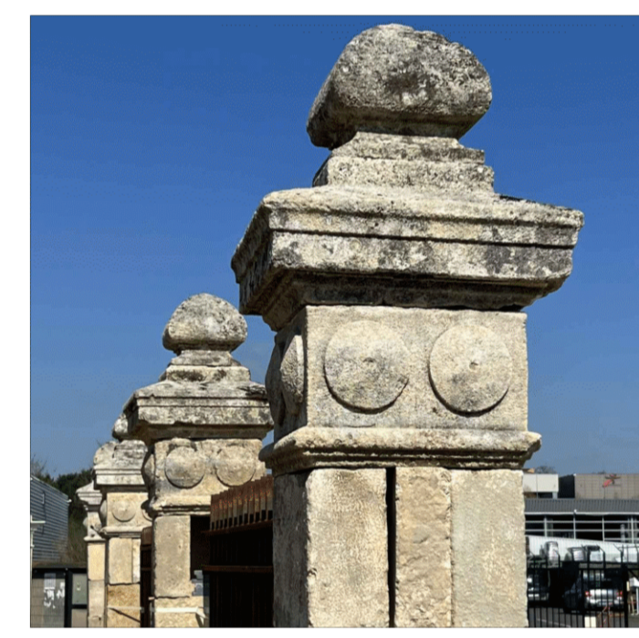
PILLAR CAP CORNICE DETAIL