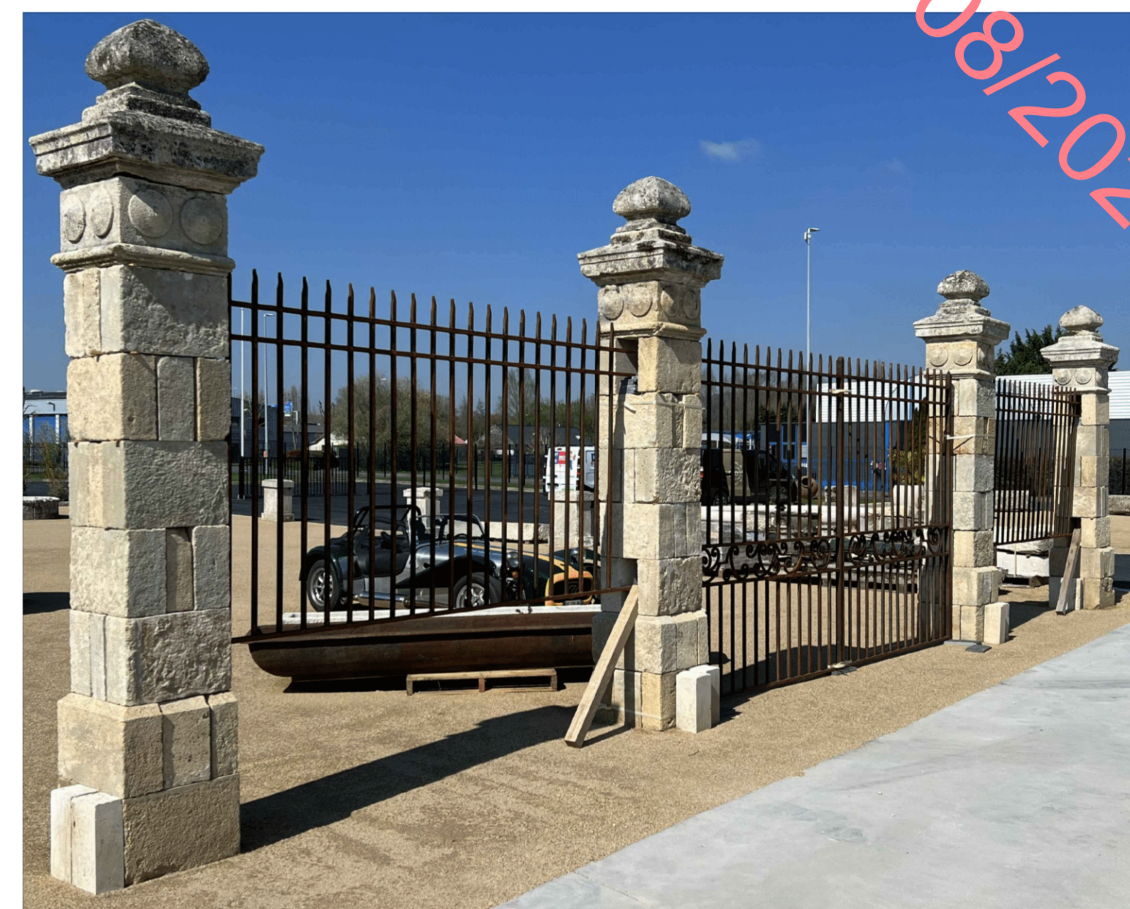
SIDE VIEW OF NEW GATES TO TINAKILLY HOUSE