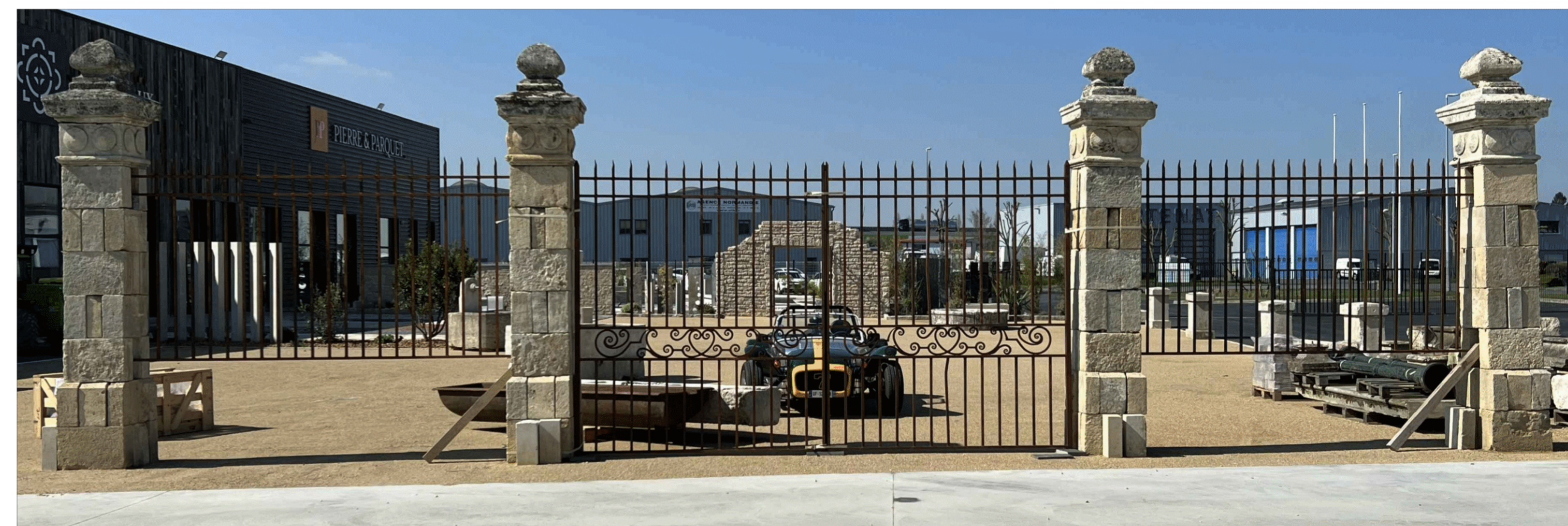
NEW ENTRANCE GATES TO TINAKILLY HOUSE NATURAL STONE WALL TO BE BUILT BELOW SIDE RAILINGS