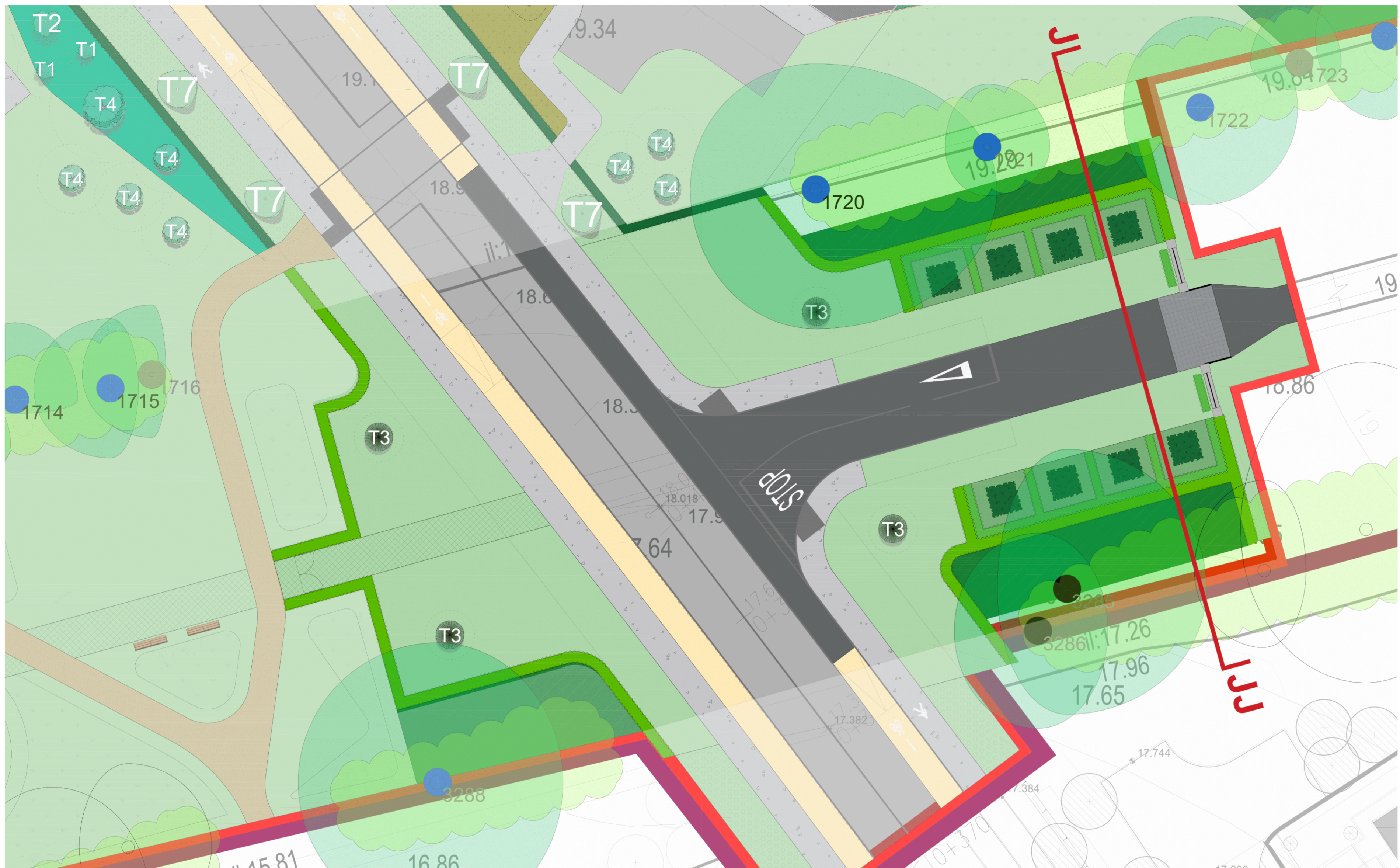
PROPOSED NEW ENTRANCE TO TINAKILLY HOUSE PLAN SCALE: 1:200/A1