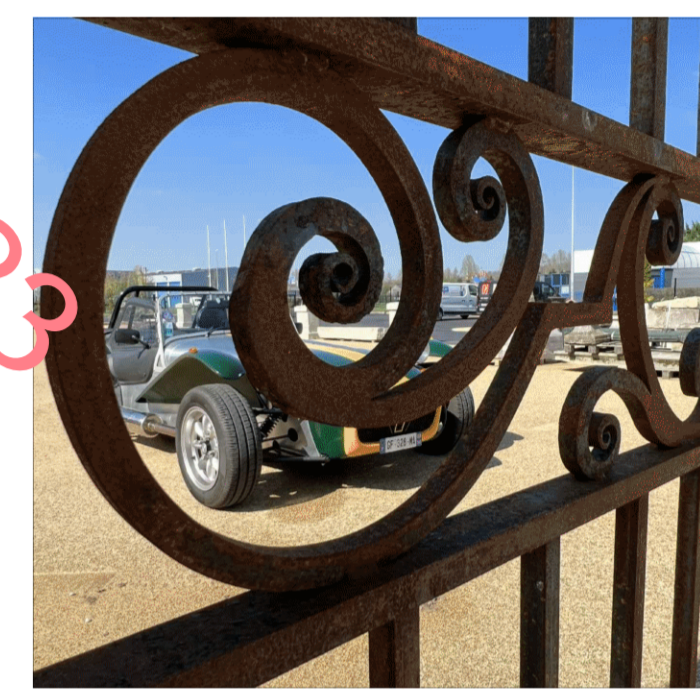
RAILING DETAIL FOR VEHICULAR GATES