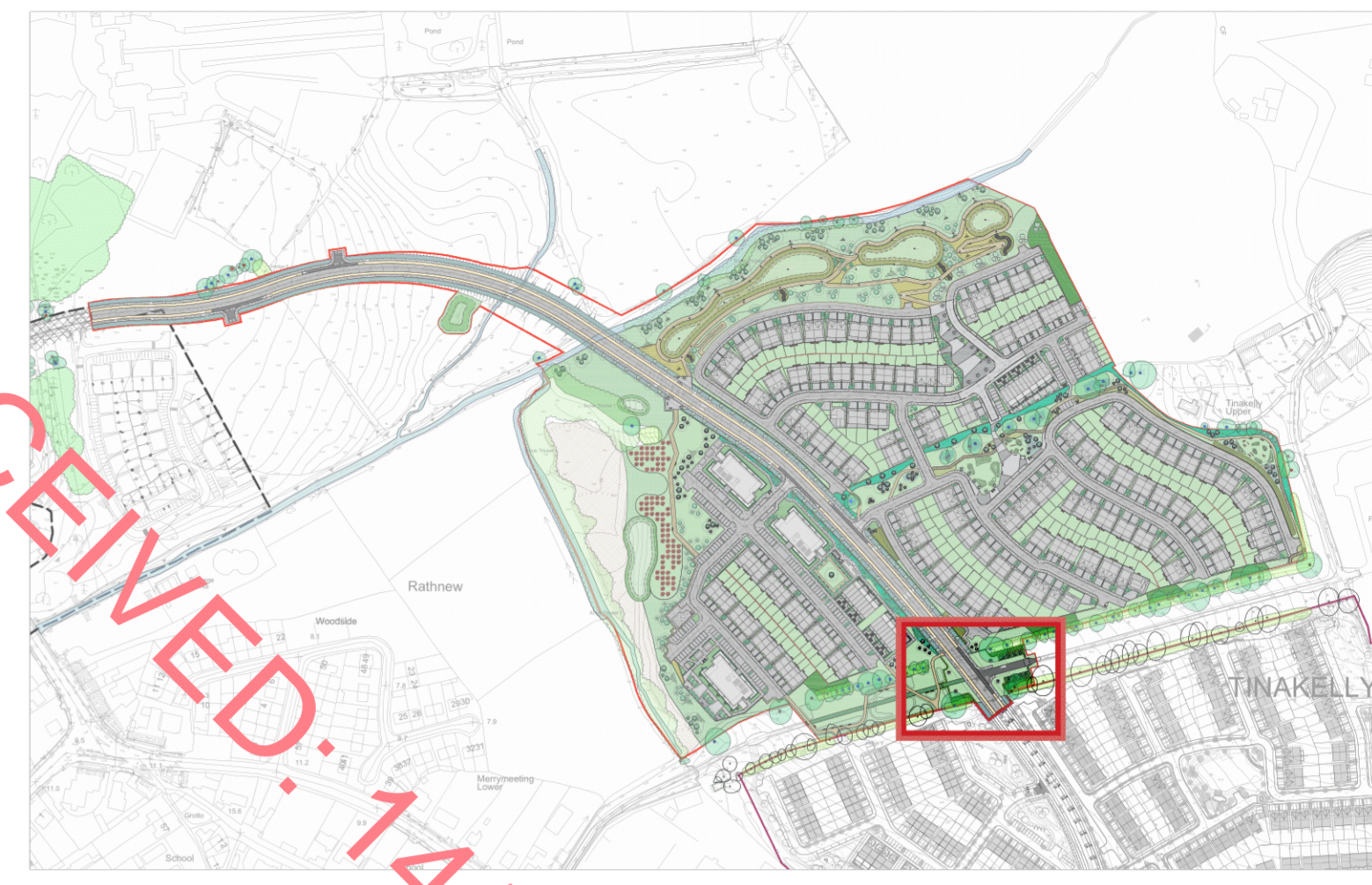
INDICATION PLAN SCALE: 1:5000/A1